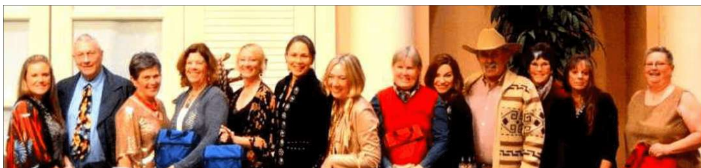
Current Board of Directors